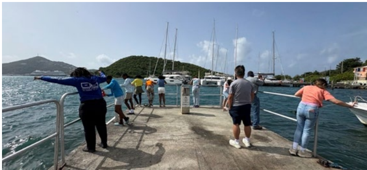
Figure 4. (above) DFW staff assisting children handline fishing on the dock at the Gustave Quetel Fish House during the DFW and Heliopolis program fishing clinic.