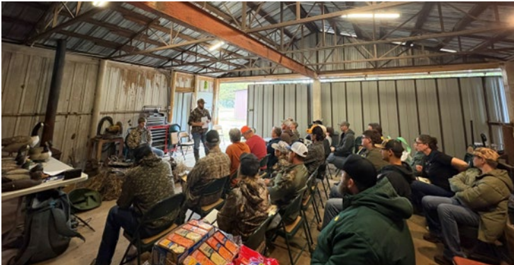
A waterfowl field day (above)