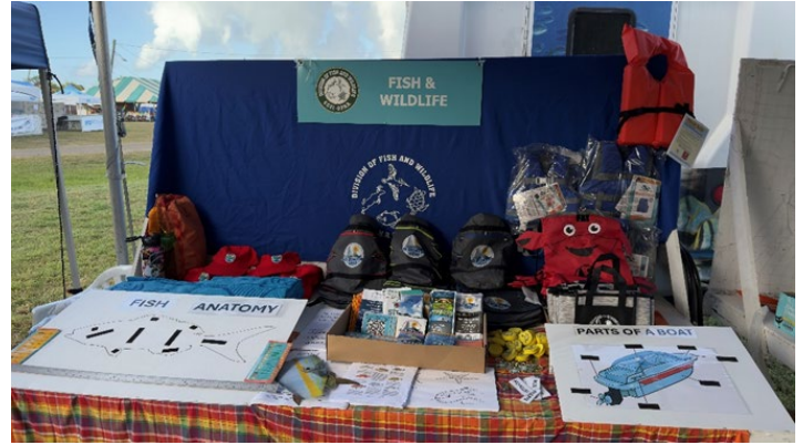
Figure 2. (above) Display of the Division of Fish and Wildlife booth with activities and outreach materials at the 2025 St. Croix District Agriculture Fair.