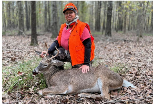
Beyond Becoming an Outdoors Woman Participant and Harvest