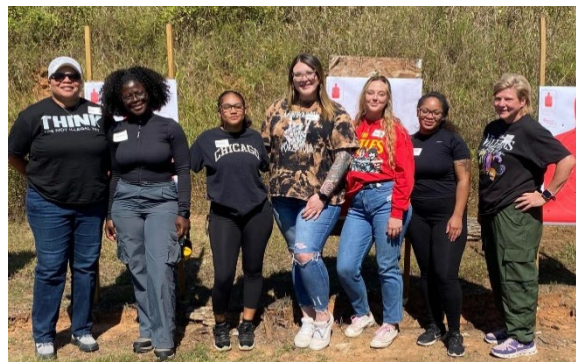
2025 Ladies Basic Handgun Class