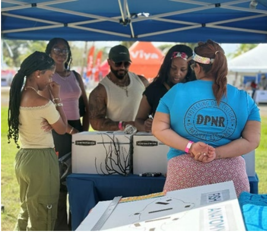
Figure 1. (above) DFW staff engaging with the public at the 2025 St. Croix District Agriculture Fair.