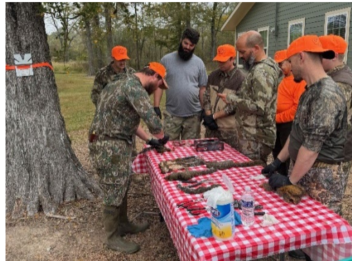
Squirrel Hunt 101