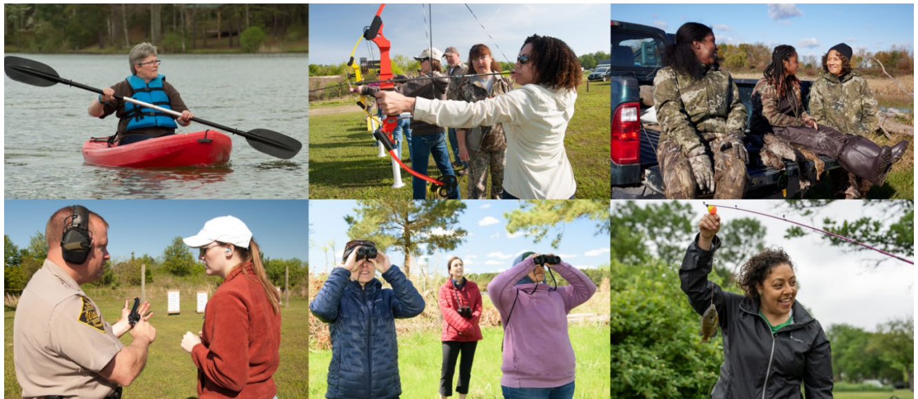
Outdoor Skills Academy for Women Montage ( https://www.ncwildlife.gov/education/outdoor-skills-academy )