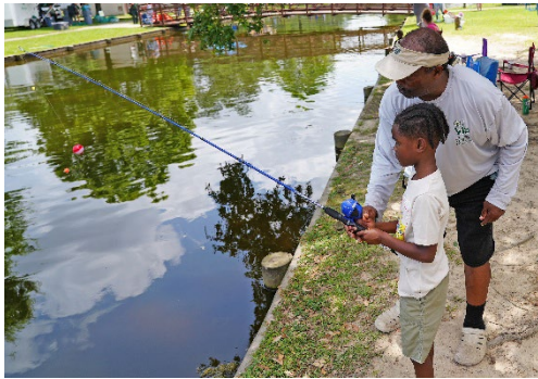
Volunteer assisting at a Youth Fishing Rodeo