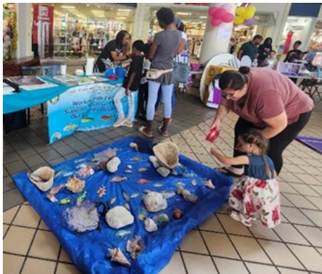
Figure 5. (above on left) DFW staff providing outreach materials and assisting stakeholders in guided activities at the 2025 St. Thomas-St. John Kid's Expo hosted by the Virgin Islands Children's Museum at the Tutu Park Mall.