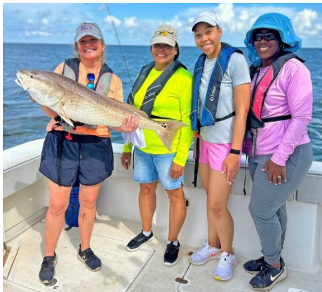
1 Women's Fishing Workshop Participants with a Red Drum