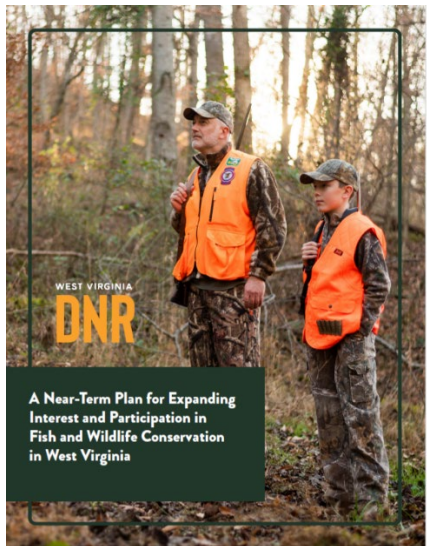
Cover of Conservation Relevance Plan