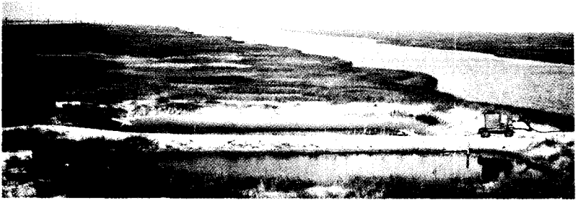
Figure 1. Brackish-water ponds (1/8-acre) used in shrimp rearing experiments.

To determine growth during the experiment, 40 shrimp were seined from each pond weekly, weighed after surface moisture was removed with absorbent paper tissue, measured, and returned to the ponds.