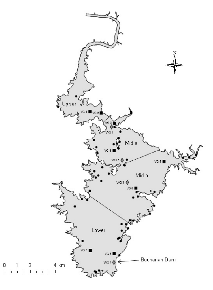
Figure 1. Map of Lake Buchanan depicting capture locations for striped bass (circles), vertical gill net forage survey stations (squares), and water quality stations (diamonds). The reservoir was stratified longitudinally into four zones for forage survey sampling and analyses.

Adult (>500 mm TL) striped bass were collected monthly from Lake Buchanan from August 2007 to March 2008 using experimental gill nets and electrofishing. Gill nets were 38.1 m by 2.4 m, consisted of five panels (25-, 38-, 51-, 64-, and 76-mm bar mesh), and